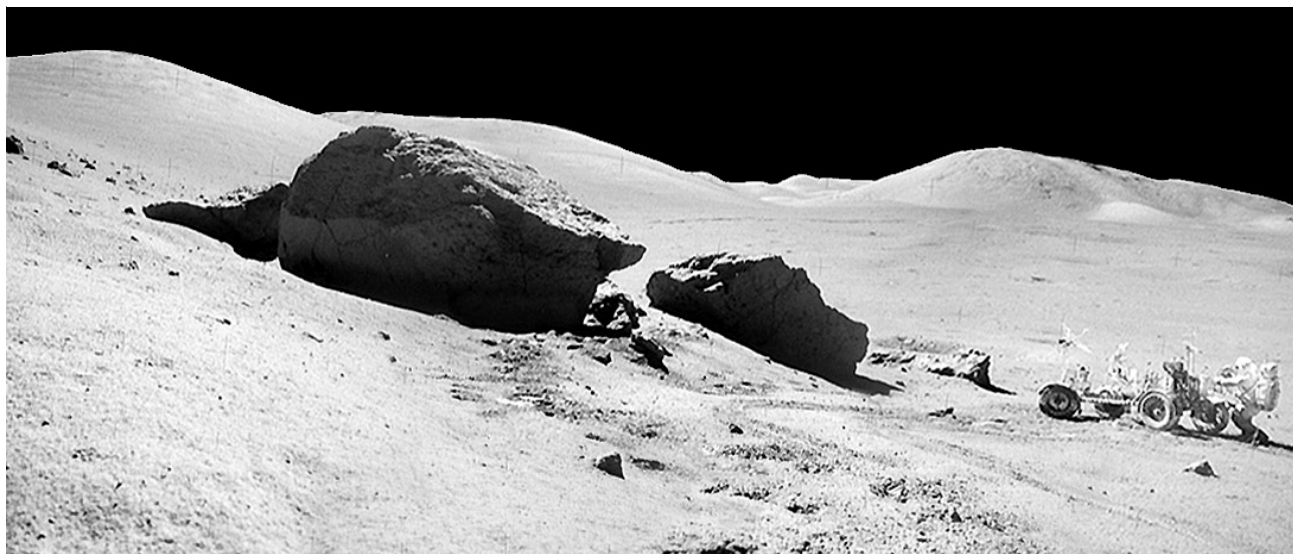
Figure 44 - The large boulder at station 6, Apollo 17, has rolled down from the North Massif. Samples of this boulder are all breccias with a poikiloblastic texture typical of a melt sheet. ( note the astronaut pushing his rover back uphill)

Lunar breccias are the lithified aggregates of elastic debris and melt generated by meteorite bombardment of the lunar surface. Most of the breccias returned by the Apollo missions were formed in the ancient lunar highlands about 3900 to 4000 million years ago. A few breccias (sample 15405) are younger and were formed from the lunar regolith (fig. 2). In the Apollo collection, 59 breccia samples weigh over 500 g each, and there are many more samples with smaller sizes. These breccias have a wide variety of matrix-textures - from fragmental to vitric to crystalline. A wide range of crater sizes are found on the Moon, and it is easy to see why a wide range of breccia types is also present. Lunar breccias can originate from either large or small craters and/or from different radial distances from large craters.