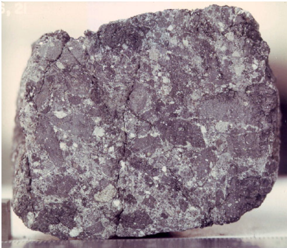
Figure 47 - Sawn surface of fragmental lunar breccia 14306 illustrating the polymict nature of lunar breccias. This is a sample of the Fra Mauro Formation and is typical of ejecta from large basins. NASA photo no. 72-22103

Compared with pristine lunar rock, all lunar breccias contain relatively high Ir and Au contents. It is thought that these trace elements come from meteoritic material that has bombarded the Moon. Distinctive chemical signatures of the added meteoritic component have even been used to identify the lunar basin of origin (Hertogen et al. 1977). Apparently, the vaporized meteorite becomes entrained and thoroughly mixed with the target material during a single impact. Calculations show that about 1 to 2 weight percent of meteorite material has been admixed, into lunar breccias. Melted iron particles from meteorites can be found in the matrix of lunar breccias. Other meteorite minerals are completely obliterated.