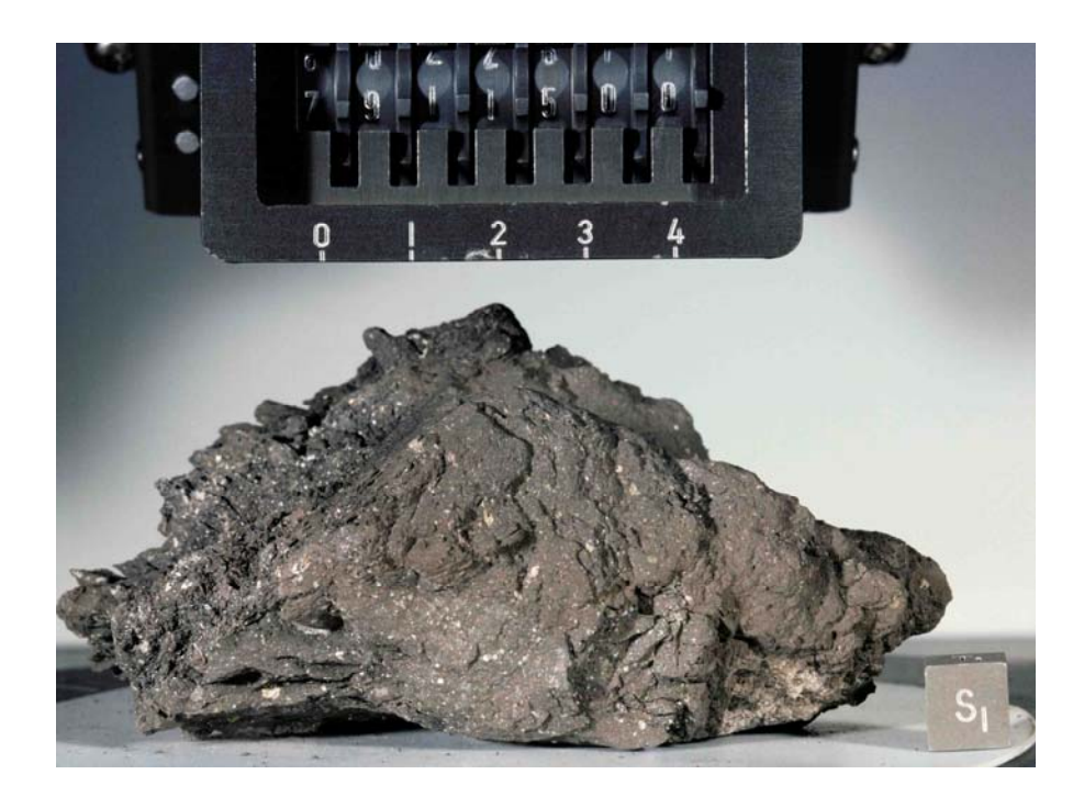
Figure 1: Hand specimen photograph of 79115,0.

chondrites for the LREE and 20-25 x chondrites for the HREE (Fig. 3). A negative Eu anomaly is present ((Eu/Eu*)<sub>N</sub> = 0.68]. In addition to the major and trace elements, Jerde et al. (1987) also reported the I_s /FeO value of 56 for 79115 and a Fe ^\circ concentration of 0.97 ewp (Table 1). The I_s /FeO value was also reported by McKay et al. (1988). Jovanovic and Reed (1980) reported the Cl and P_2O_5 concentrations in 79115 (Table 1).