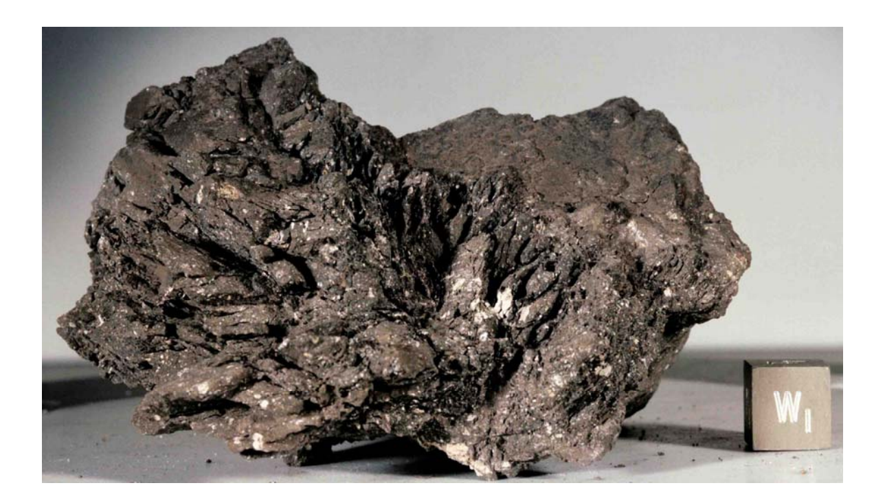
Figure 2: Hand specimen photograph of 79115,0.