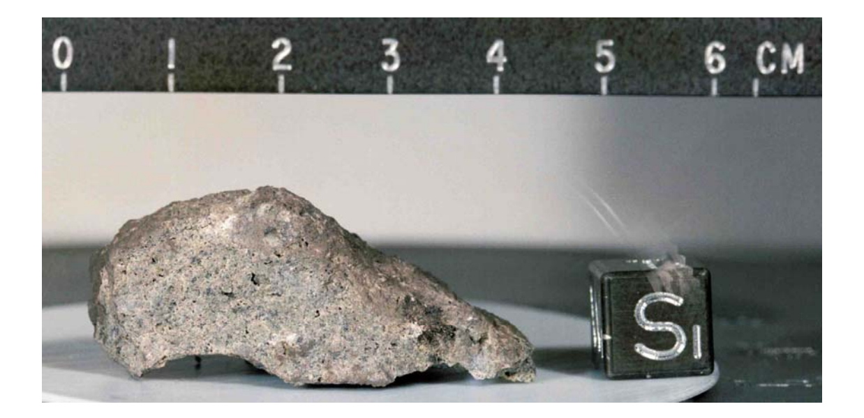
Figure 1: S face of sample 72373. The exposed surface (at the top) has a darker-colored patina; the lower area is broken surface. Scale in centimeters. S-73-15356.

Chemical analyses of the bulk matrix are given in Table 1, with the rare earth elements plotted in Figure 3. The chip analyzed was an exterior chip, but is in any case similar in chemistry to the other Boulder 2 matrix samples. The siderophiles are assigned to Group 3, correlated with Serenitatis.