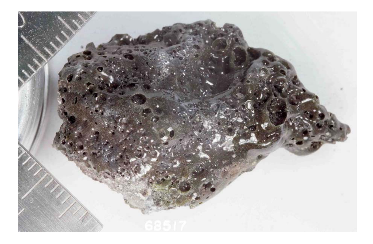
FIGURE 1. Smallest scale division in mm. S-72-51260.

<u>PROCESSING AND SUBDIVISIONS</u>: A single chip was removed to make thin section ,1.