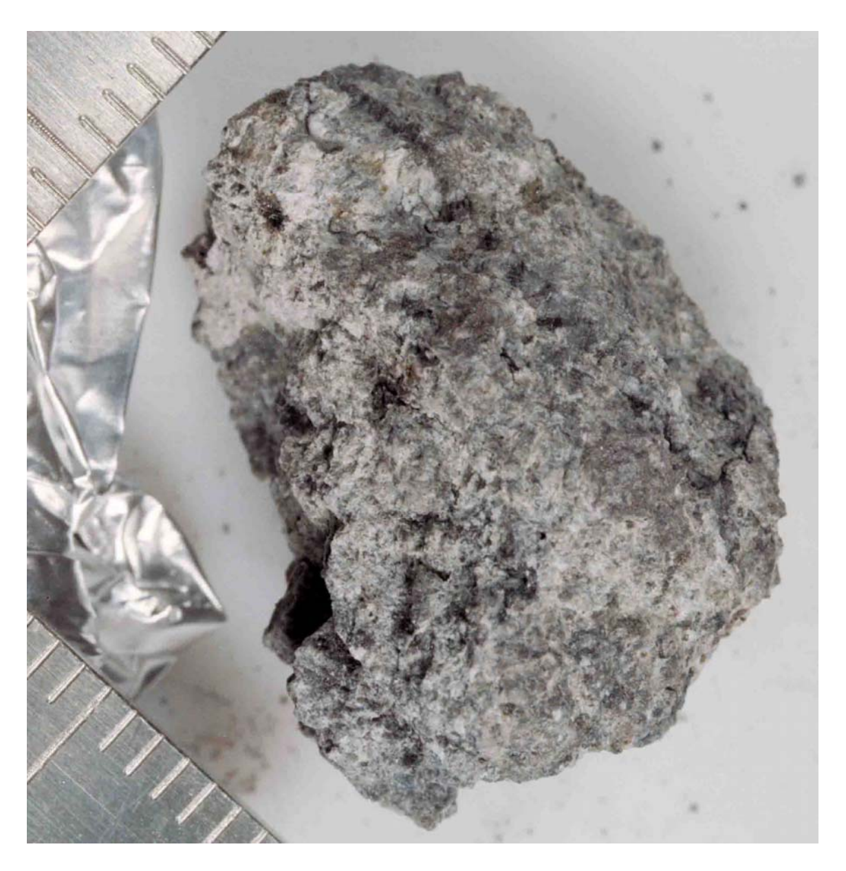
FIGURE 1. Smallest scale division in mm. S-72-49568.

<u>INTRODUCTION</u>: 67757 is a dark gray, coherent, fine-grained impact melt (Fig. 1) with a texture that varies from subophitic to poikilitic. It is a rake sample collected halfway between the White Breccia boulders and House Rock, and has a few zap pits on one side.