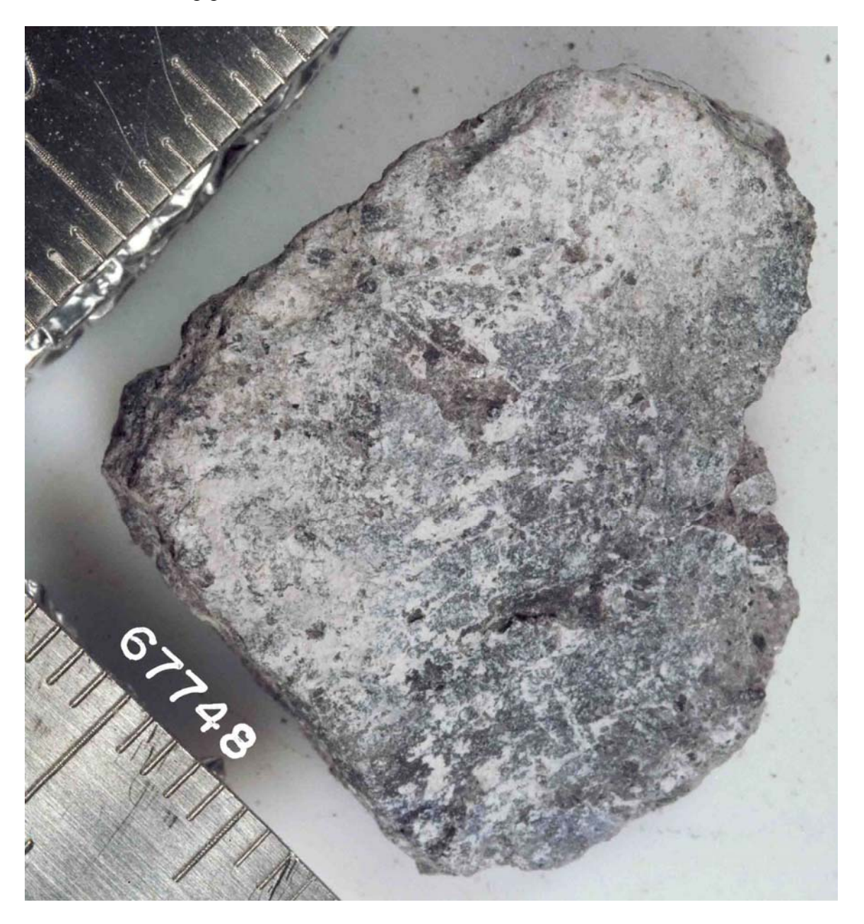
FIGURE 1. Smallest scale division in mm. S-72-49558.

<u>INTRODUCTION</u>: 67748 is a coherent, dark, homogeneous breccia (Fig. 1) which is fine-grained and apparently bonded by melt. A white powder partially coats the surface. It is a rake sample collected halfway between the White Breccia boulders and House Rock, and lacks zap pits.