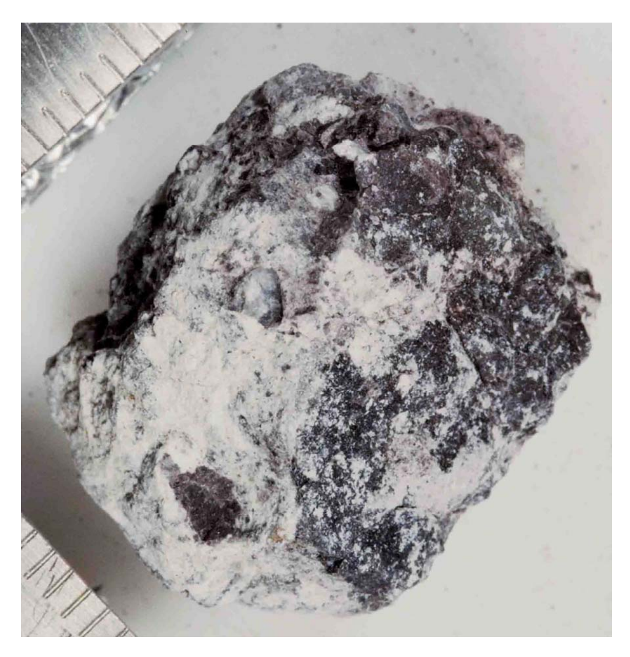
FIGURE 1. Smallest scale division in mm. S-72-49540.

<u>INTRODUCTION</u>: 67717 is a coherent, dark, polymict breccia with a white coating up to 0.5 mm thick over three-quarters of the surface (Fig. 1). It has a glassy to cryptocrystalline matrix. It is a rake sample collected halfway between the White Breccia boulders and House Rock, and lacks zap pits.