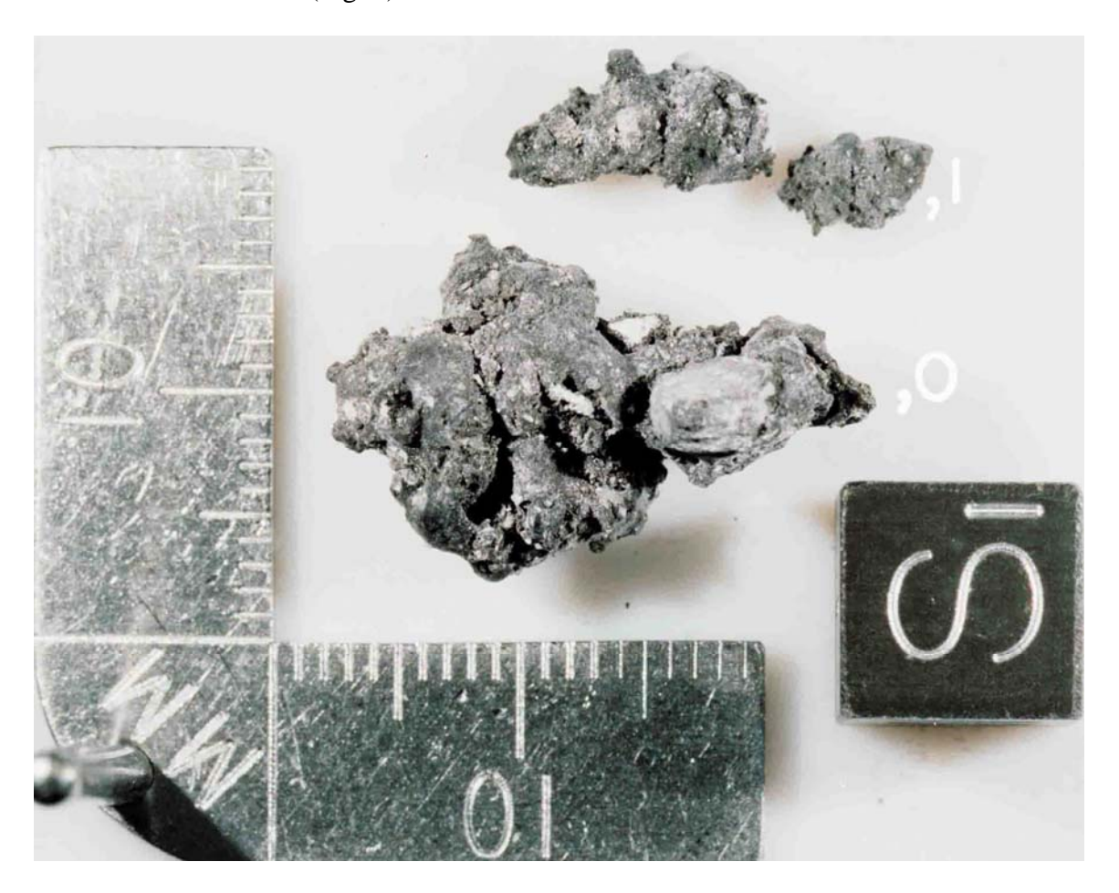
FIGURE 1. S-80-28628.

<u>PROCESSING AND SUBDIVISIONS</u>: Originally 67688 was the smallest of four fragments of similar appearance which were grouped together as 67628. During this cataloguing they were renumbered separately (67685-67688). A chip (,1) of 67688 was taken for a thin section (Fig. 1).