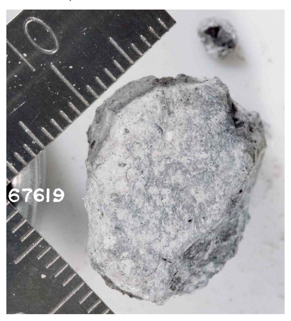
FIGURE 1. Smallest scale division in mm. S-72-51046.

<u>INTRODUCTION</u>: 67619 consists of fine-grained, clast-rich, homogeneous breccia (Fig. 1) with a melt matrix containing aligned plagioclase laths. It is a rake sample collected 30 m east of the White Breccia boulders, is subangular, and free of zap pits. It is coated with white powder.