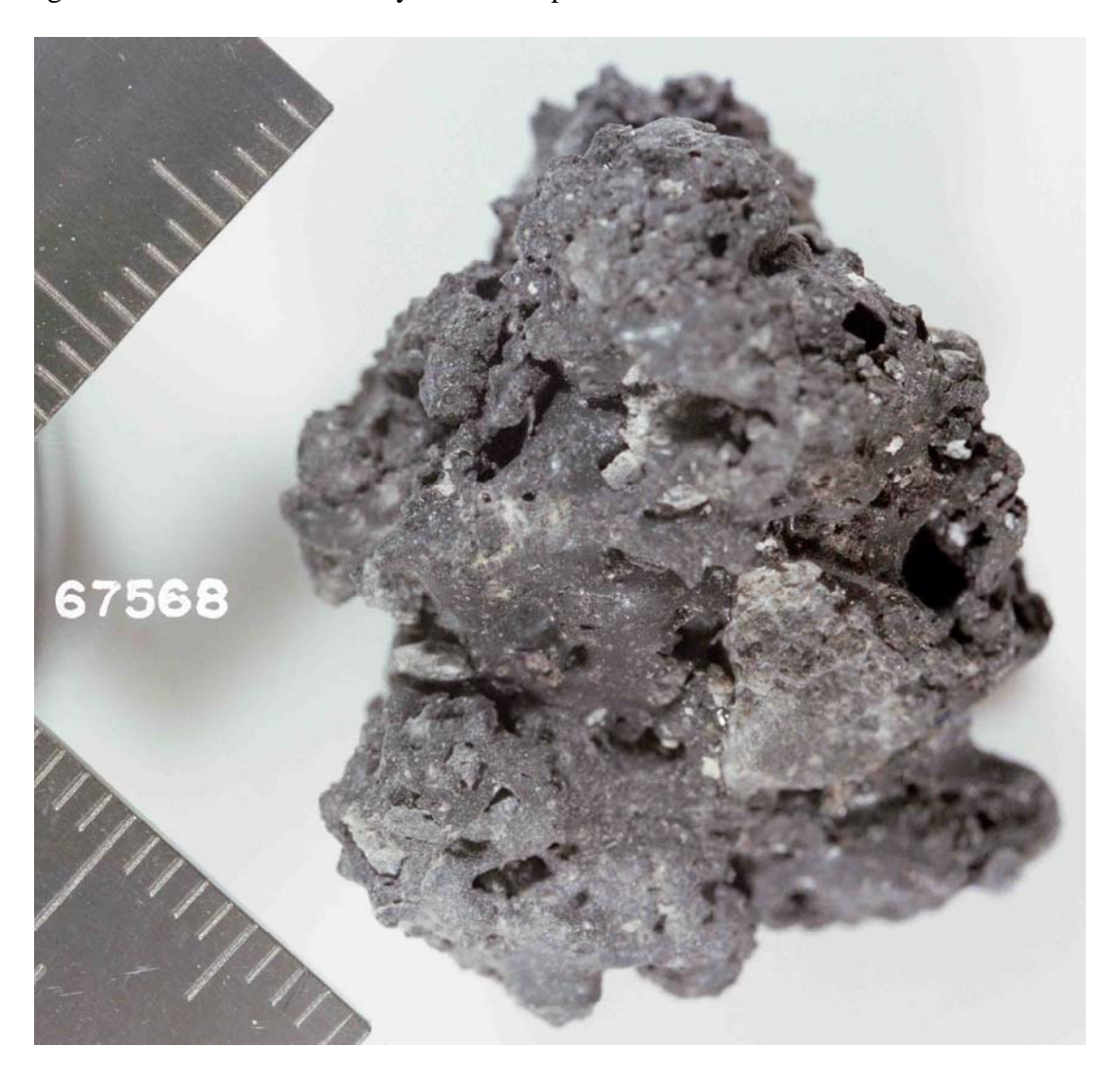
FIGURE 1. Smallest scale division in mm. S-72-51055.

<u>PETROLOGY</u>: 67568 consists largely of a devitrified vesicular glass (Fig. 2). In places where it is not devitrified the glass is clear and colorless; where devitrified it is brown and contains plagioclase spherulites and needles. It also contains Fe-metal and troilite blebs. Enclosed clasts are not numerous and are mainly plagioclase, with some lithic fragments. The latter are mainly basaltic impact melts.