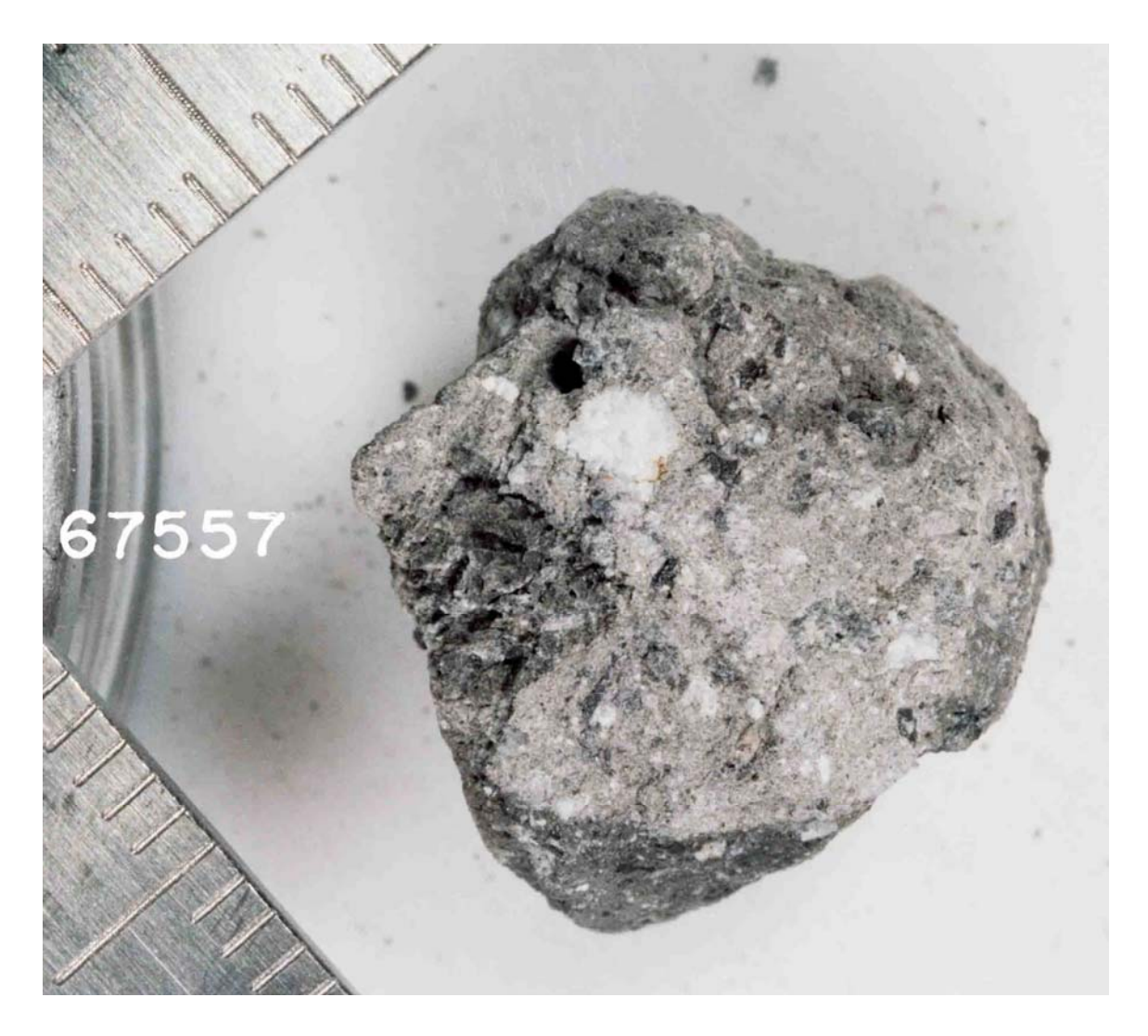
FIGURE 1. Smallest scale division in mm. S-72-51270.

<u>PETROLOGY</u>: 67557 has an opaque, fine-grained, glassy matrix and is clearly polymict (Fig. 2). Its clasts include plagioclases, mafic minerals, glasses, agglutinitic (opaque, vesicular) glasses and lithic fragments. The latter include feldspathic granulites, poikilitic melts, and other breccias.