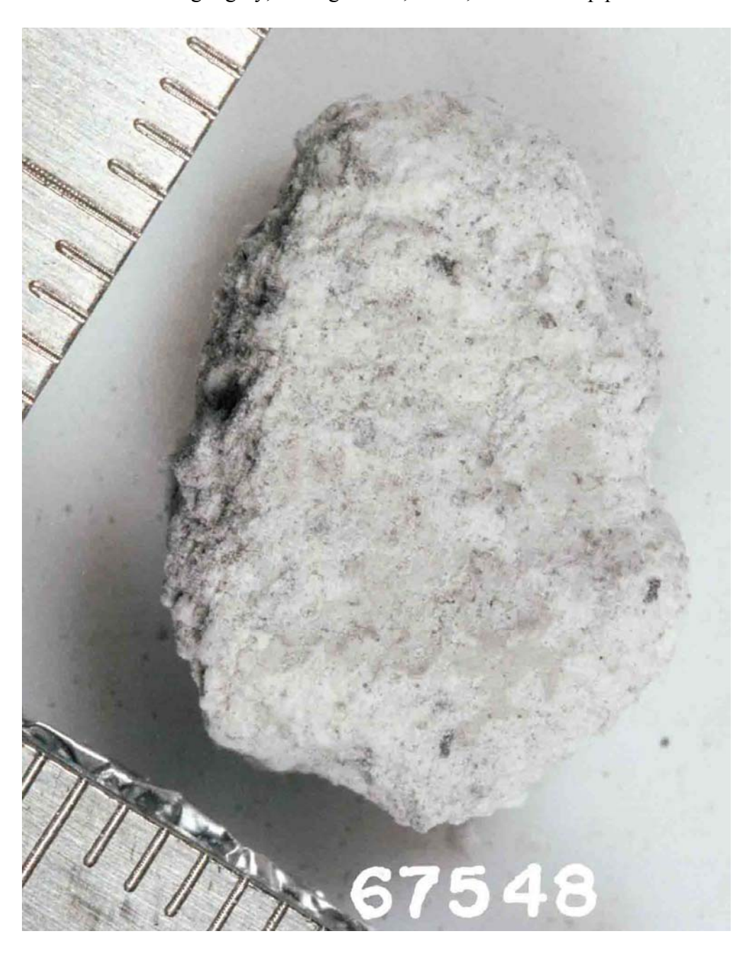
FIGURE 1. Smallest scale division in mm. S-72-51282.

<u>INTRODUCTION</u>: 67548 is a porous, polymict, glassy breccia containing shocked plagioclase clasts and lithic clasts (Fig. 1). It is a rake sample collected near the White Breccia boulders. It is light gray, homogeneous, ovoid, and lacks zap pits.