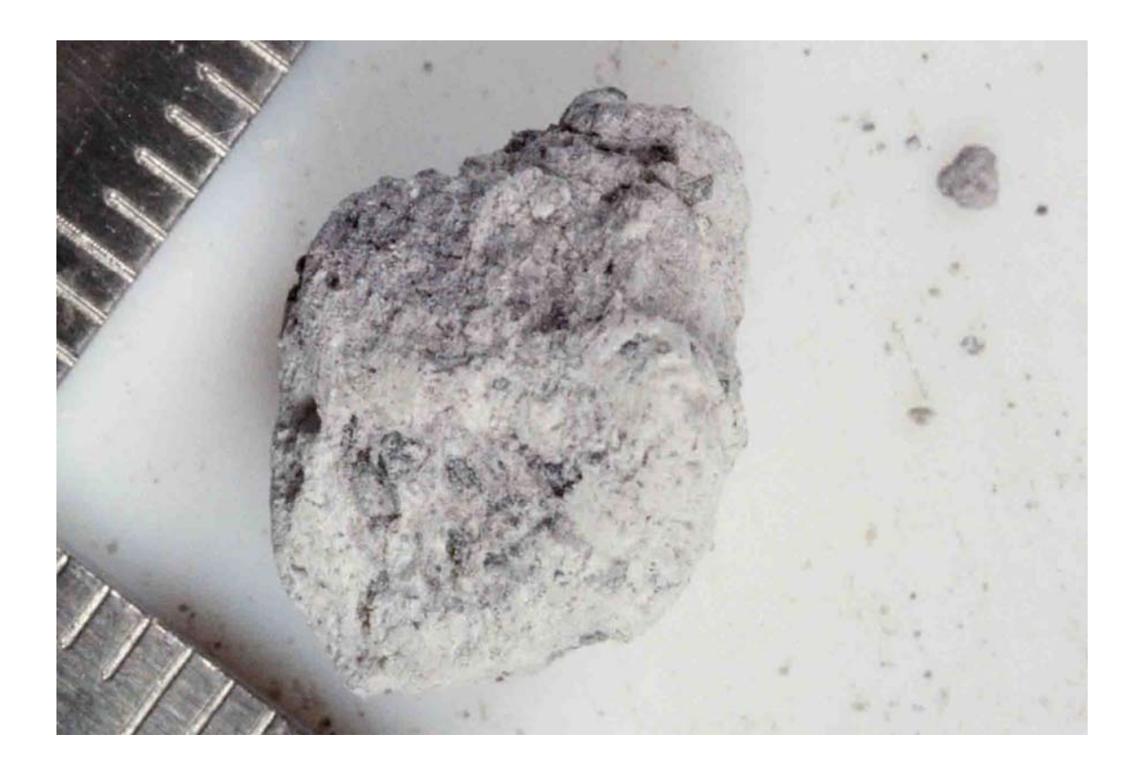
FIGURE 1. Smallest scale division in mm. S-72-49544.

<u>PROCESSING AND SUBDIVISIONS</u>: Fragments were chipped off to obtain material for thin section ,1.