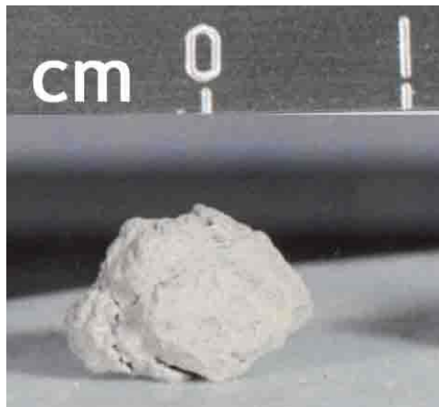
FIGURE 1a. S-72-41421.

INTRODUCTION : 67495 is possibly a gray aphanite clast in a gray breccia matrix, but the original data pack description notes that the sample is too dust covered for real identification. It was taken from a regolith sample collected by the White Breccia boulders.