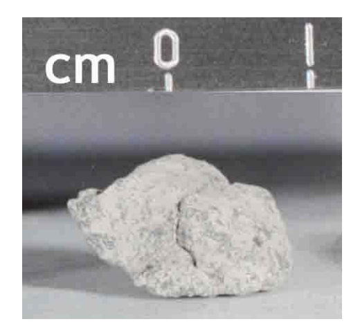
FIGURE 1a. S-72-41421.

<u>INTRODUCTION</u>: 67489 is a dark gray, coherent and aphanitic rock (Fig. 1). It contains a few vugs, some scarce, pale yellow mineral grains, and plagioclases up to 300 \mu m. It is possibly a basaltic impact melt. It was taken from a regolith sample collected by the White Breccia boulders and has some zap pits.