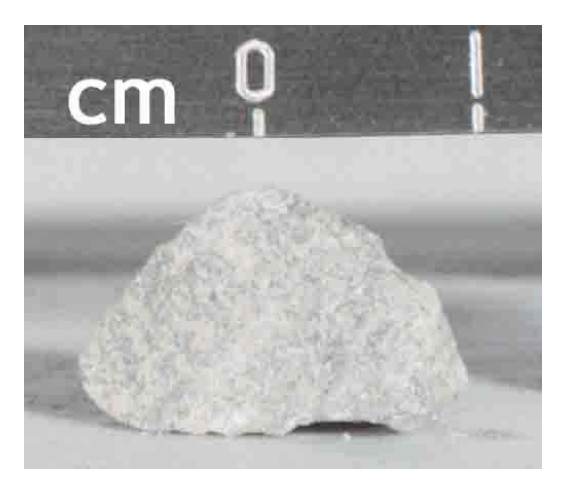
FIGURE 1a. S-72-41421.

<u>INTRODUCTION</u>: 67487 is a medium dark gray, coherent and aphanitic rock (Fig. 1). It has scarce vugs. It was taken from a regolith sample collected by the White Breccia boulders and lacks zap pits.