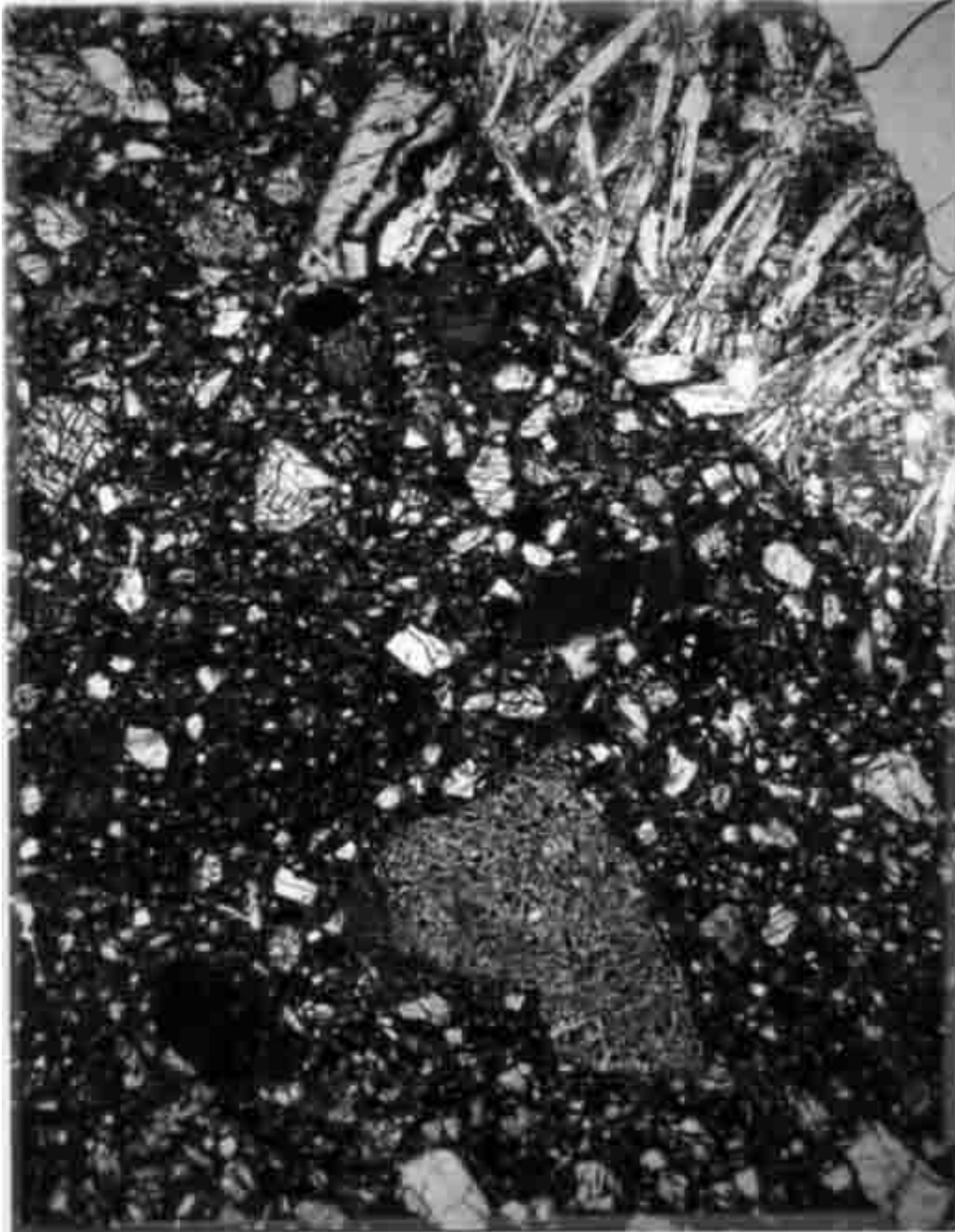
Figure 2. Photomicrograph of 15528,4. Width about 3 mm. Transmitted light.

PETROLOGY : 15528 is a friable regolith breccia containing a few prominent basalt clasts (Figs. 1, 2). The large basaltic fragment in Figure 2 appears to be a KREEP basalt. Diverse glass and mineral fragments are common. McKay et al. (1984) measured an I_0/FeO of 16-25 (21 in Korotev, 1984, unpublished), an immature index.