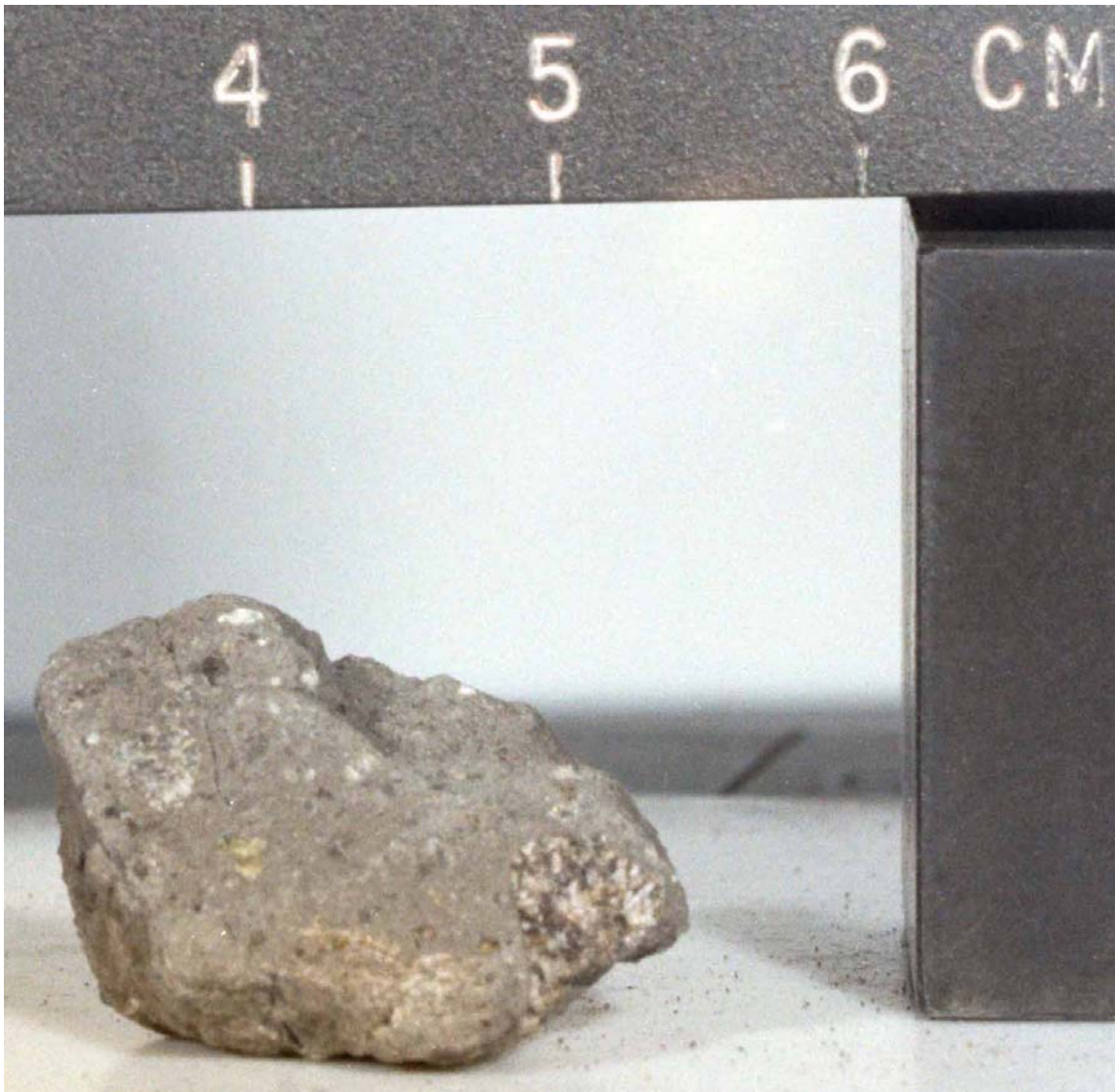
Figure 1. Macroscopic, pre-chip view of 15528. S-71-43647

INTRODUCTION: 15528 is a friable regolith breccia with a composition apparently quite different from local regolith. It is brownish gray and subrounded (Fig. 1) and has a smooth surface with few to no zap pits. 15528 was collected approximately 60 m northeast of the rim of Hadley Rille, near 15529, but it has not been identified on photographs.