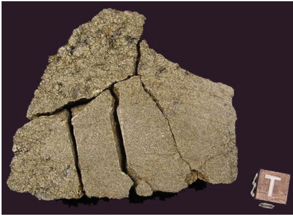
Figure XXXII-2: Sawn surface of NWA3171.