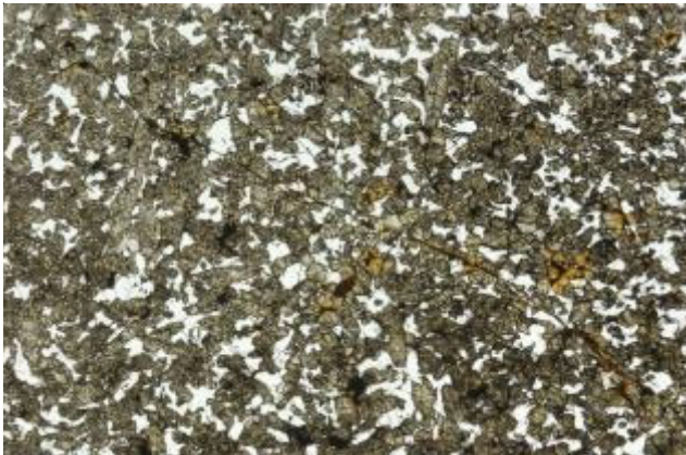
Figure XXXII-3: Thin section photomicrograph showing texture of NWA3171. Scale is 1.5 cm across. Note the thin shock veinlet (black glass) and brown alteration stain.