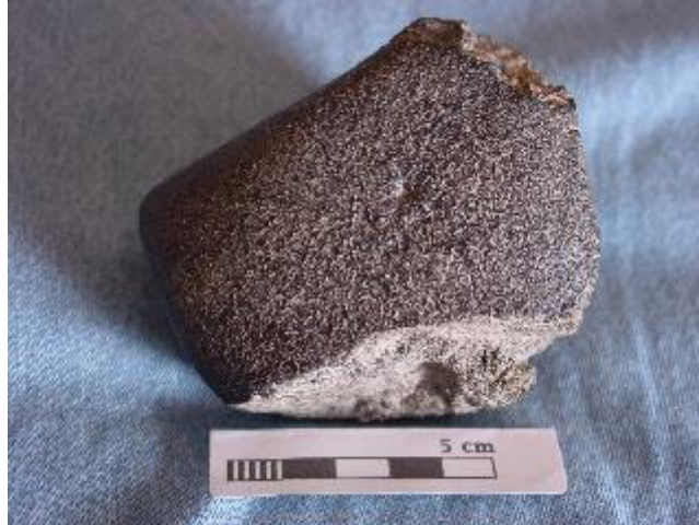
Figure XXXII-1: Complete NWA3171 stone showing flow lines in the back fusion crust on the shield-like front face.